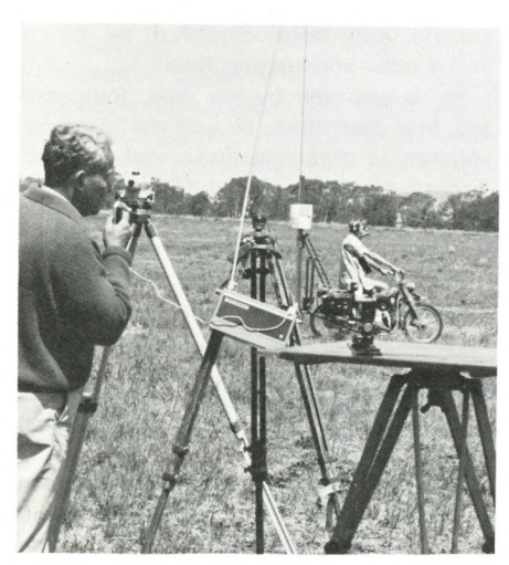
Carel Hart sights through an automatic level while Len Eacott moves off on the specially-fitted motorcycle.

These days, in the rich crop growing district of the Darling Downs 100 miles west of Brisbane, the sight of Carel Hart's quaint machine bouncing across the fields with its survey staff whipping like a mast in a gale, is as familiar as a sheaf of wheat.